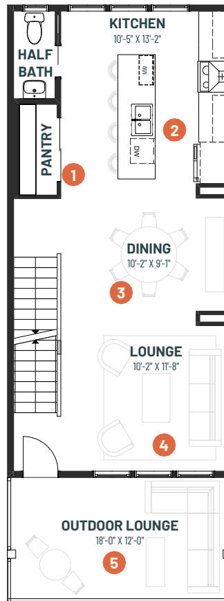
MAIN FLOOR 684 SQ.FT.